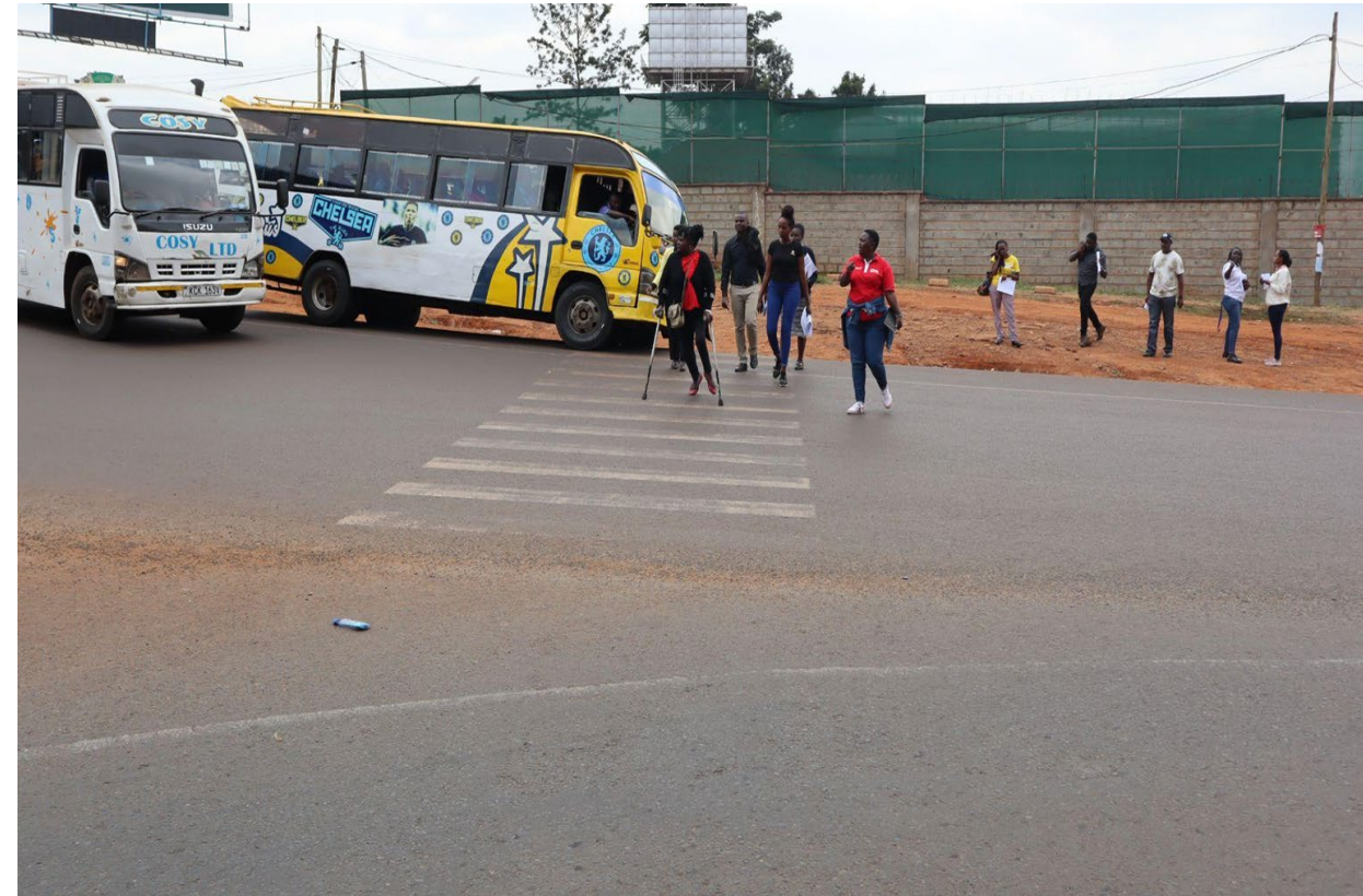
Road Accessibility Audit