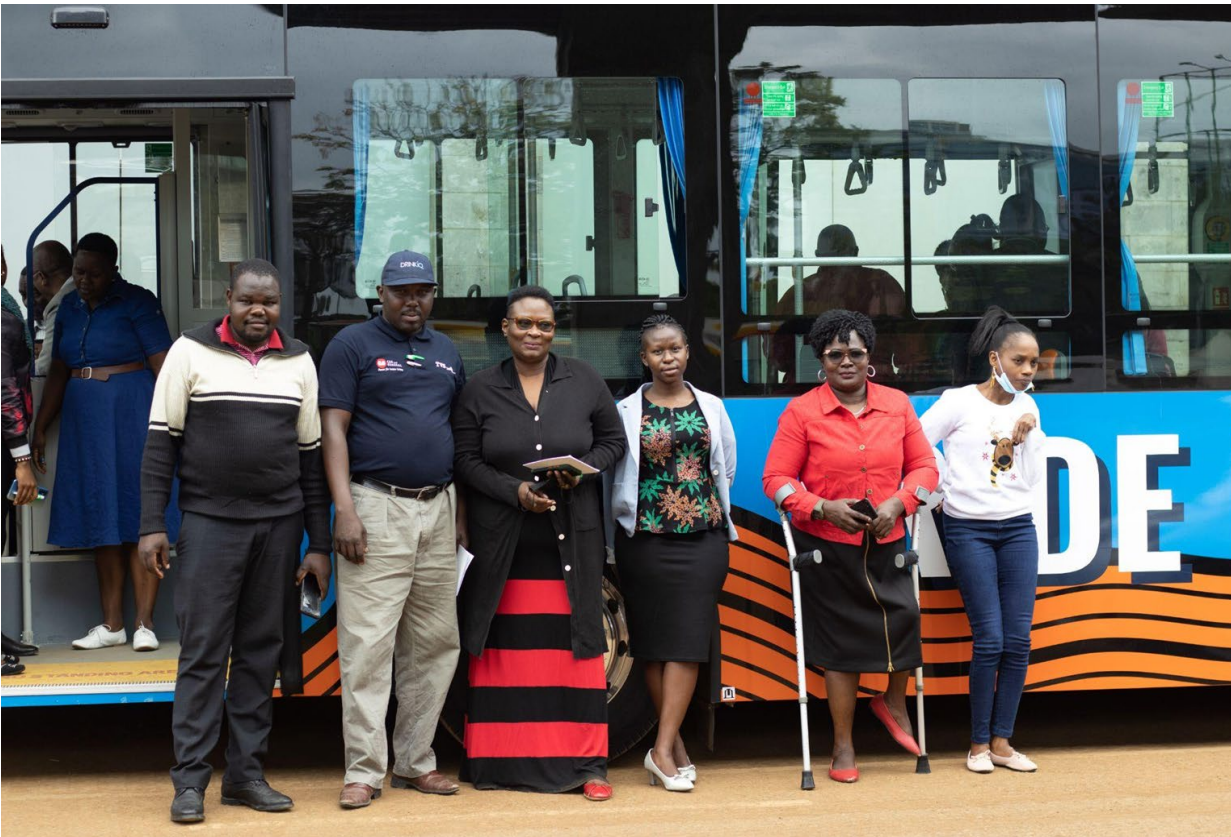
Roam( EV) Bus Accessibility Audit