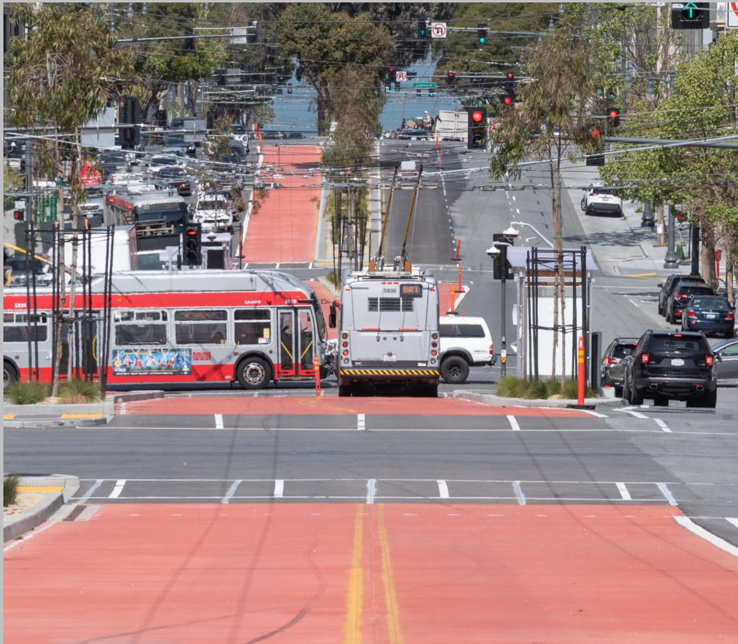
Van Ness BRT corridor 0 Van Ness BRT Stops C Cable Car 38R 45 Muni Lines 130 Golden Gate Transit