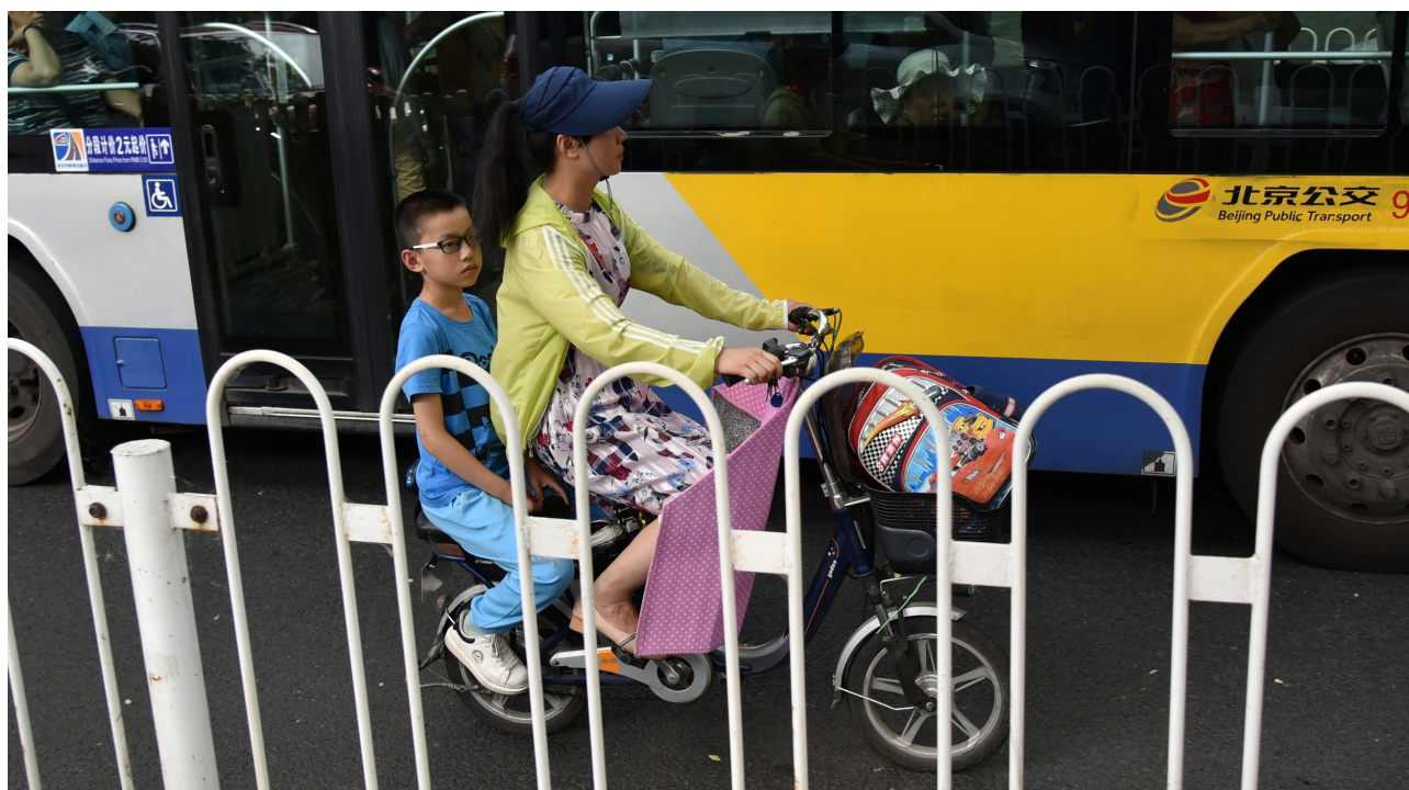
A family rides an electric bicycle along a downtown street in Beijing.

The largest existing market for e-bikes is China, with more than 183 million e-bikes in urban areas 5 and a reported 350 million e-bikes countrywide in 2021. 6 The prevalence of e-bikes in China can be attributed to a variety of factors, including: 1) bans on motorcycles implemented in the late 1990s, 2) challenges associated with acquiring motorcycle licenses, 3) relatively short travel distances in Chinese cities, and 4) affordability of e-bikes. E-bikes became a popular replacement for motorcycles after major Chinese cities banned motorcycle licensing and use in the early 2000s. 7 As a result, e-bikes in China are more visually similar to mopeds than bicycles, though their weight and power align with low-speed e-bikes. Many relatively low-cost e-bike options (low-end models start at around USD $300) are available, too. Chinese cities have also expanded investments in cycle infrastructure over the past decade, providing safe and comfortable travel spaces for e-bike riders.