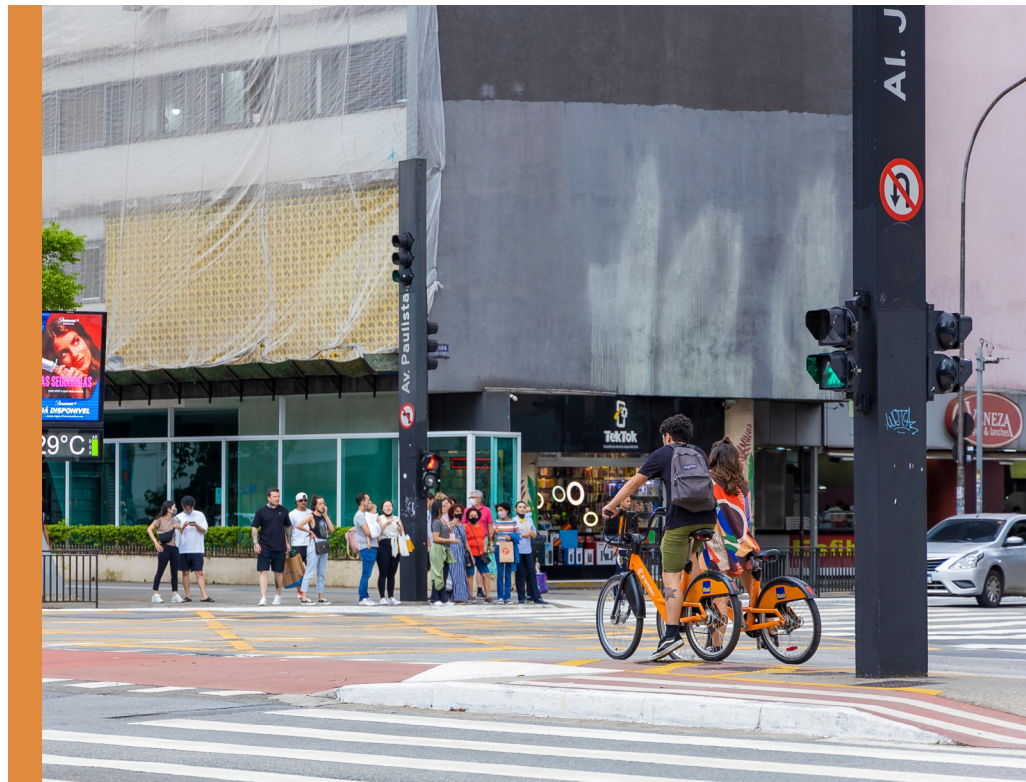
Tembici electric bikes are part of the company's bikeshare fleet in Sao Paulo.

Since 2018, both public and privately operated bikeshare systems have been integrating e-bikes into their fleets. Most bikeshare systems that include e-bikes see high utilization of e-bikes compared to conventional bicycles; for example, in New York City, electric Citibikes are used for two out of five (40%) trips, despite making up only 20% of the fleet. 47 Shared e-bike riders in New York have also reported connecting with public transport more than twice as often as conventional bikeshare riders. 48 Globally, as of 2022, 29% of all bikeshare systems worldwide (567 total) offer e-bikes, up from 18% of systems in 2021. 49