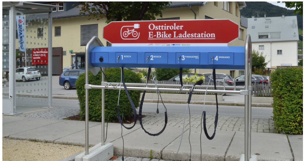
Public charging stations for e-bikes serve as a solution to charging indoors, which can be a fire hazard.

Other related safety concerns exist around e-bikes and potential conflicts with lower-speed conventional bicycles in bicycle lanes and pedestrians in shared paths or sidewalks. A Dutch study that compared adult and elderly cyclists each riding e-bikes and conventional bicycles along the same route found that the speed of elderly cyclists riding an e-bike was about the same as adult cyclists riding a conventional bicycle. 79 Both groups slowed their speeds when riding an e-bike in “complex traffic situations,” indicating that e-bike riders self-regulate their speed based on their surroundings. Observations of e-bike riders, conventional bicycle riders, and pedestrians in Shenzhen showed that conflicts between e-bike riders and pedestrians were most frequent, exposing pedestrians to higher injury risks. 80 Cities that lack sufficient infrastructure separating e-bike (and conventional bicycle) riders from pedestrians are more likely to experience these conflicts. Nonetheless, the vast majority of pedestrian injuries and fatalities come about in crashes with heavier, higher-speed motor vehicles. 81