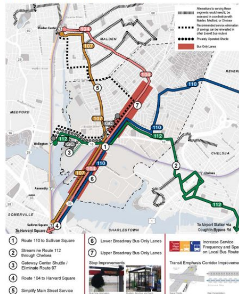
Figure 1 | Service and Route Improvements Recommendations Map

Service and route improvements include short and medium term service changes, projects, and strategies designed to improve local bus service within Everett and provide better connections to major destinations for Everett residents. Many of these recommendations are dependent upon further analysis and implementation as part of the MBTA Service Plan, which will look at service changes on a garage by garage basis.