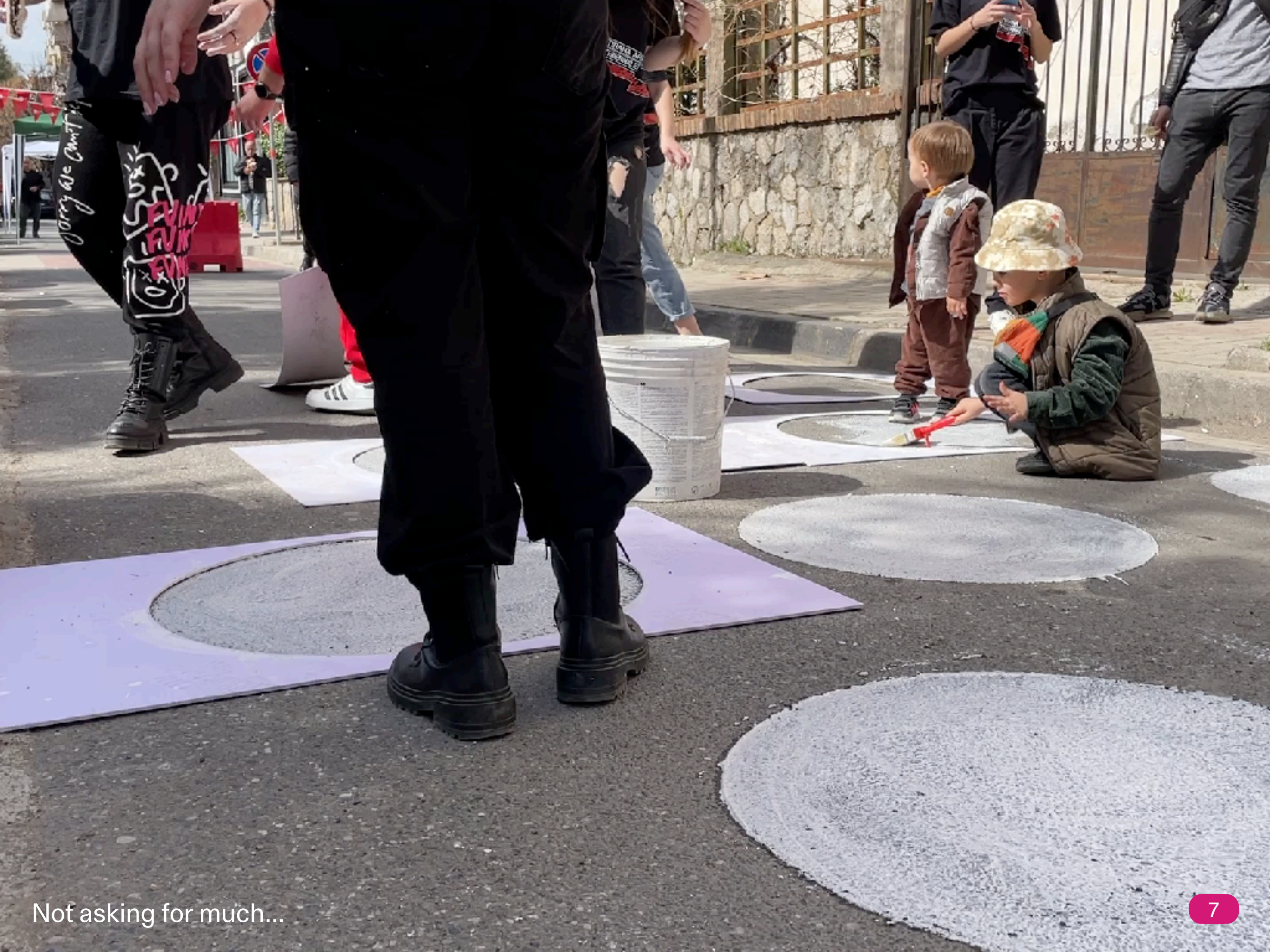
Not asking for much...