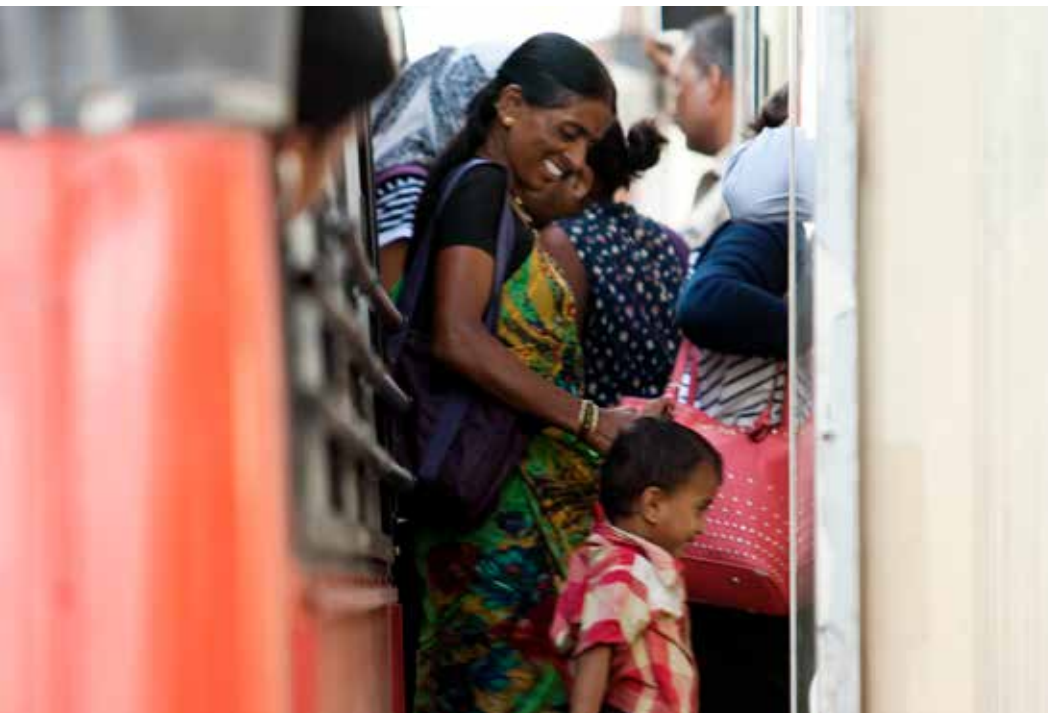
A caregiver carrying a child and walking with a toddler easily alights from a bus in Pune, India.

Diverse options would help with giving caregivers the most flexibility to make trips near and far, especially when city fabrics necessitate longer distances to these destinations and considering that they often travel in less-than-ideal conditions and are encumbered with carrying supplies. Walking is the most flexible, affordable, and accessible mode of transport. It also gives toddlers and babies more opportunities for physical activity and cognitive development. Given the demands on caregivers, walking would ideally be the first and best choice to fulfill the needs of babies and toddlers, but it only works well if services are nearby and walking conditions are good. Cycling can expand what is accessible fivefold, while providing many of the same benefits as walking. Public transport—whether it be shared 2- and 3- wheelers, minibuses, buses, bus rapid transit, or rail—is the lifeline of cities and often anchors neighborhood activity because more businesses, shops and job opportunities can be found nearby. Public transport can expand what is accessible tenfold and may be preferred when traveling with young children and carrying goods, and when it is necessary to reach services that are farther away.